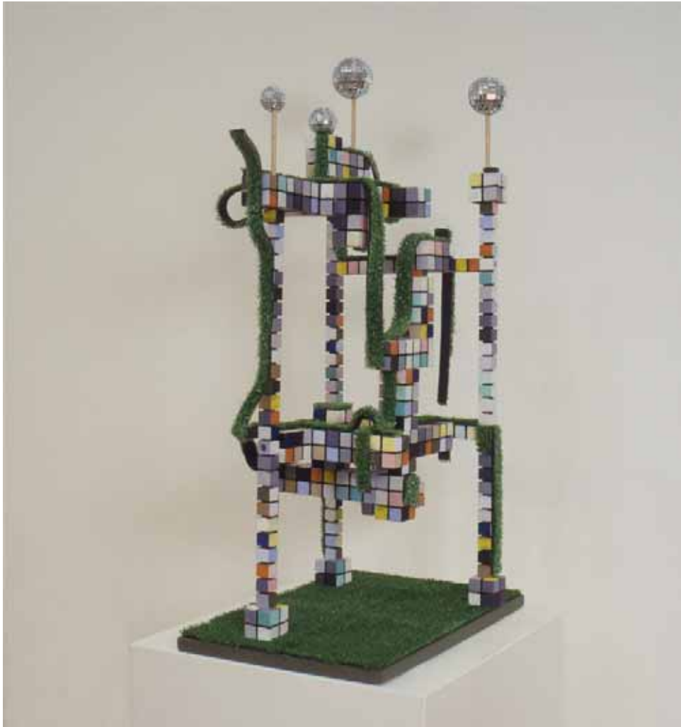
TONY COLEING AND STEPHEN KILLICK, VERTICAL GOLF COURSE (2001)