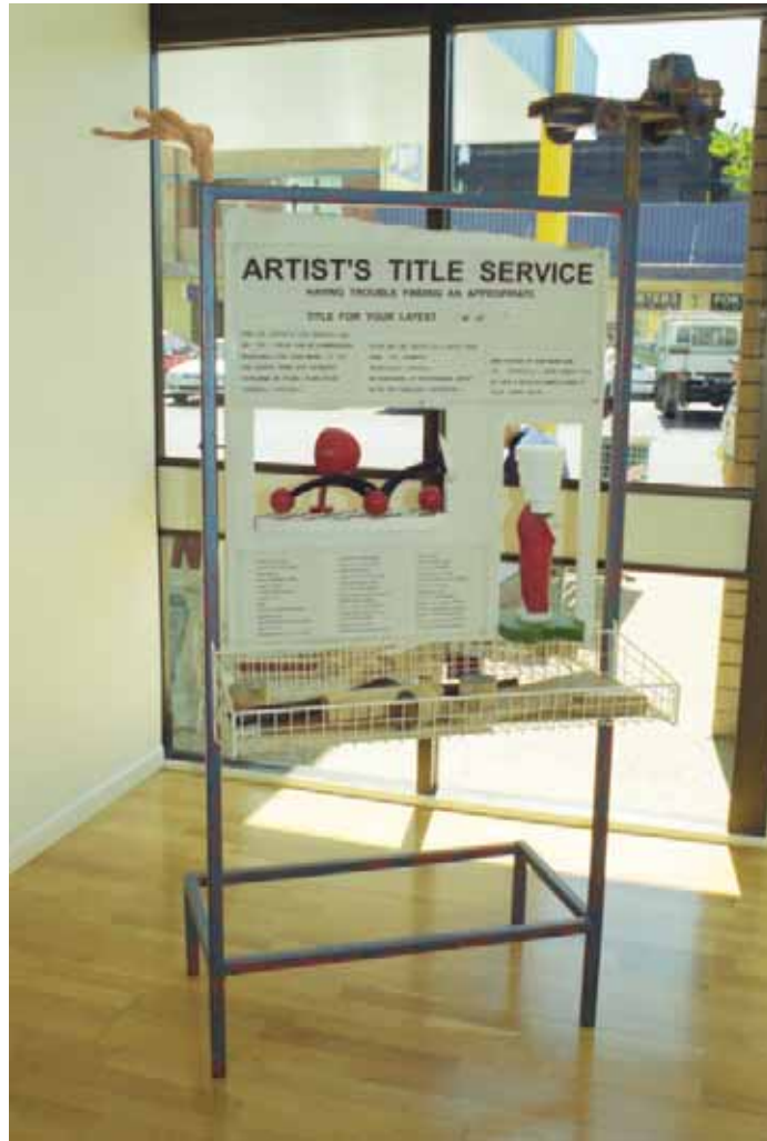
TONY COLEING AND STEPHEN KILLICK, ARTIST'S TITLE SERVICE AND REFRESH ART (2001) Mixed media 184 x 99 x 65 cm $9,350