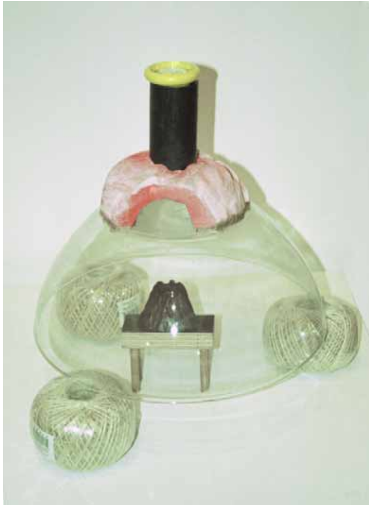
TONY COLEING AND STEPHEN KILLICK, BEARD ON A TABLE (2001)