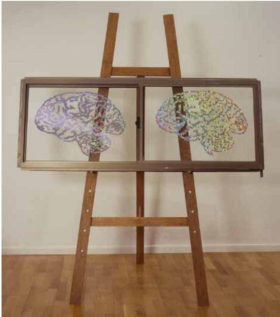
TONY COLEING AND STEPHEN KILLICK, THE SMALL GLASS [WINDOW OF OPPORTUNITY] (2001)