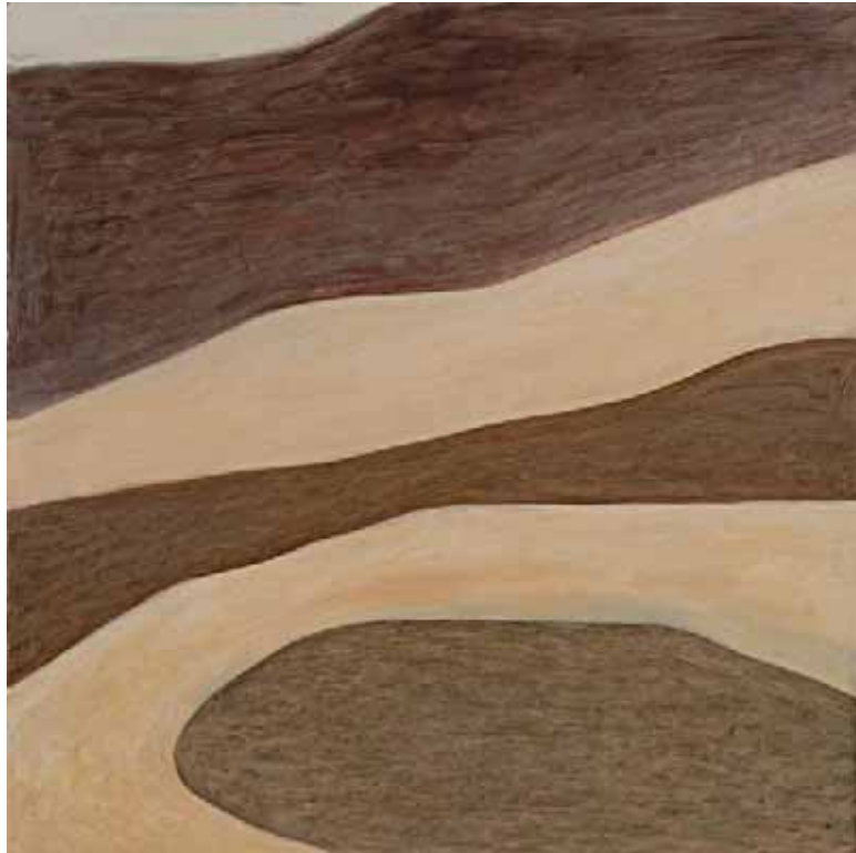
FIGURE COMPOSITION (2007)