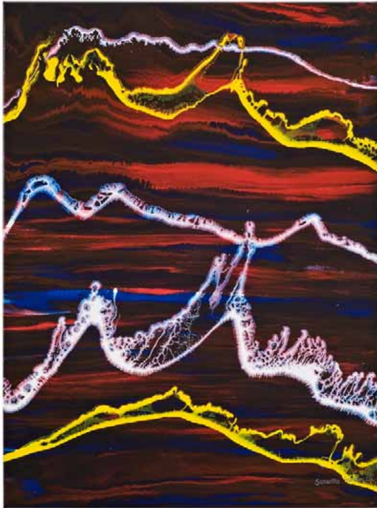
WAVE BUST (2009) SMHC 20091197/SMHAB_035 Acrylic on canvas, 103 x 76 cm $5,000