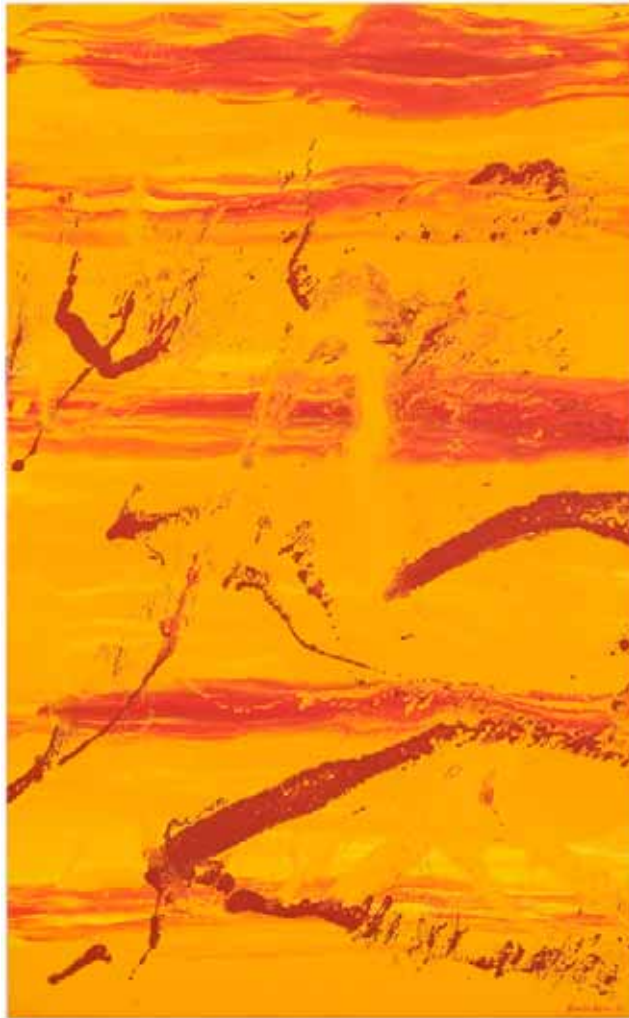
HOT, HOT FIREY DAY (2008) SMHC 20080338/SMHAB_019 Acrylic on canvas, 167 x 103 cm $10,000