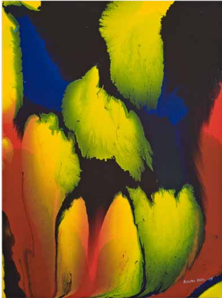
CLAUDIE MOUTH (2009) SMHC 20091295/SMHAB_032 Acrylic on canvas, 103 x 76 cm $5,000