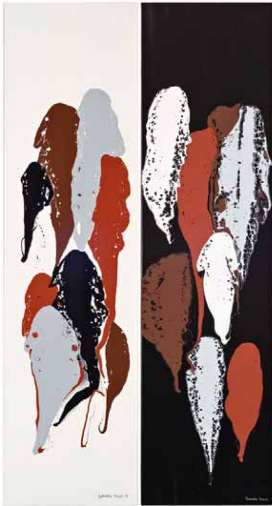
BEFORE TIME PEOPLE (2009) SMHC 20090585/SMHAB_023 Acrylic on canvas, 167 x 88 cm (Diptych) $7,000