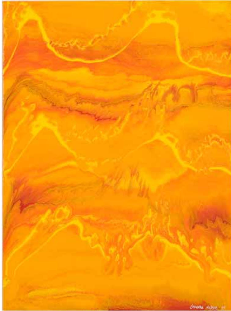
HOT, HOT HEAT WAVE (2009)