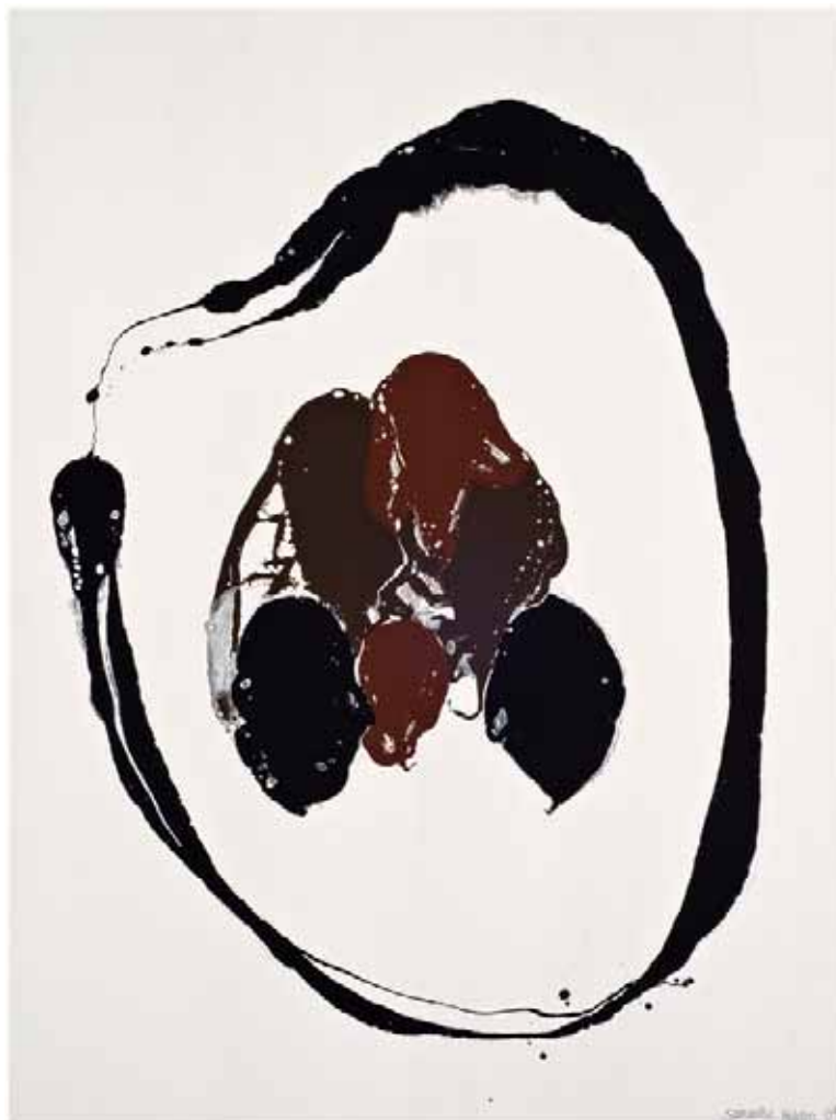
SECRET PLACE (2009) SMHC 20090263/SMHAB_041 Acrylic on canvas, 103 x 76 cm $5,000