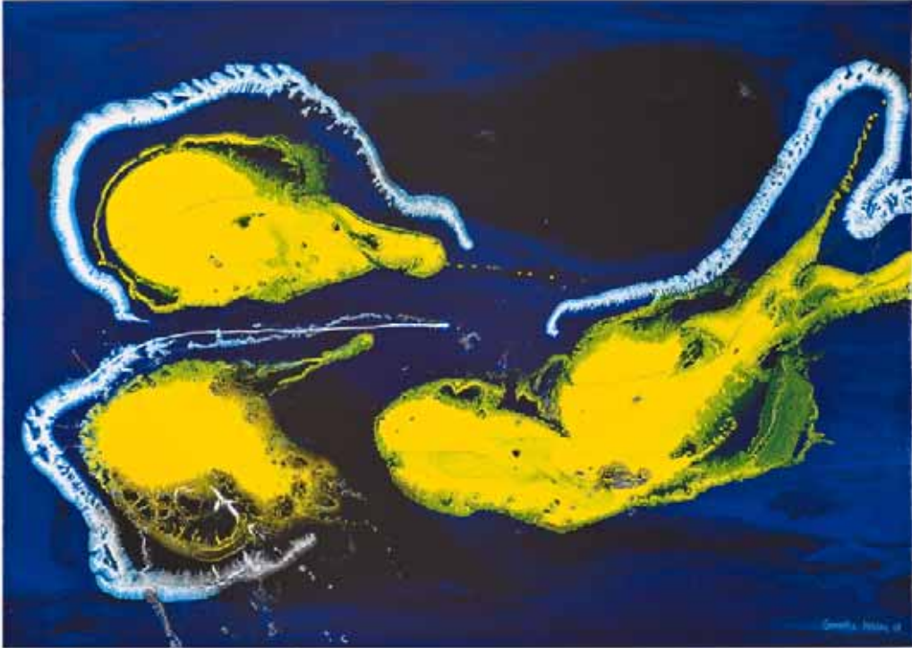
FLY OVER THE REEF (2009) SMHC 20091184/SMHAB_034 Acrylic on canvas, 104 x 74 cm $5,000