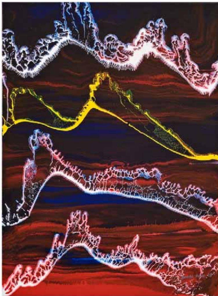
WAVE BUST ... WINDY NIGHT (2009)