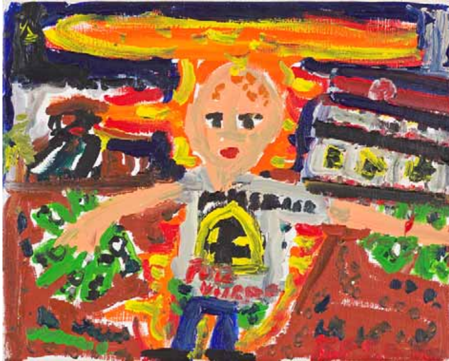
PETER GARRETT: THE MINISTER FOR FUCKING THE ENVIRONMENT (2009)