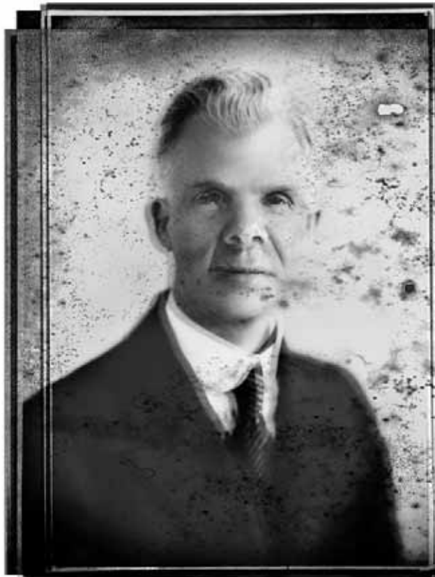
James Scullin - 1929-1932