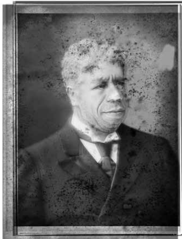
Edward Weston - 1901-1912