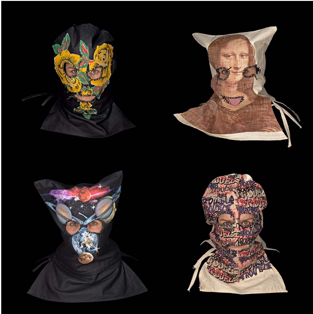
TO SEE OR NOT SEE #1 2017 Inkjet print, Edition 3, 100 × 100 cm—$6,600