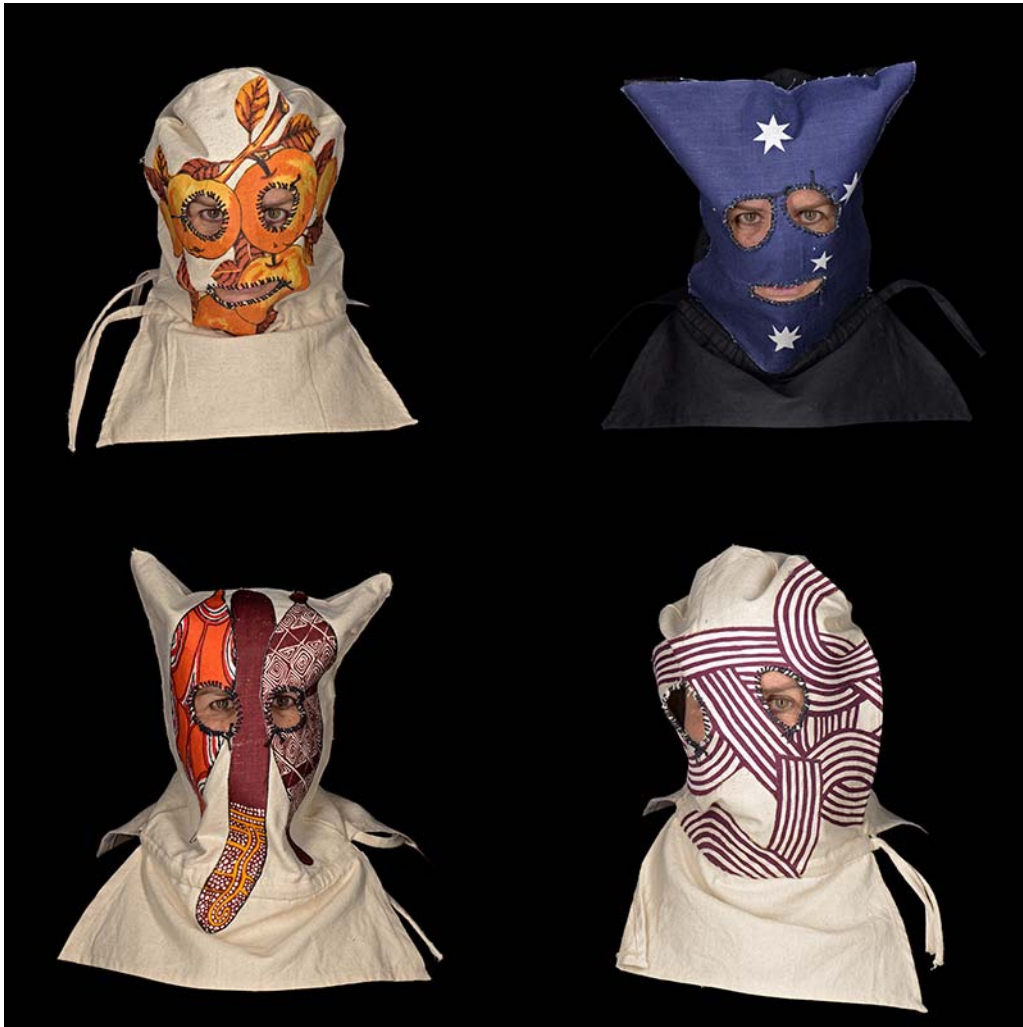
TO SEE OR NOT SEE #2 2017 Inkjet print, Edition 3, 100 × 100 cm—$6,600