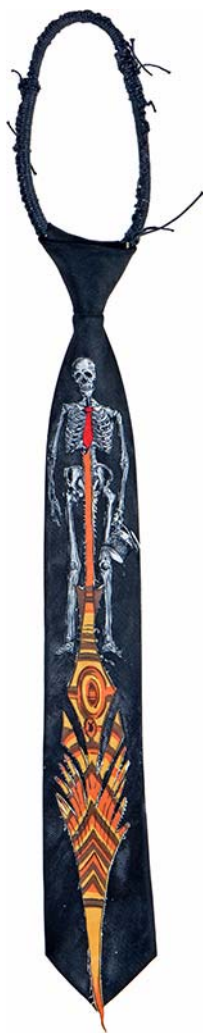
HUNG VI 2017 Mixed media 55 × 10 cm