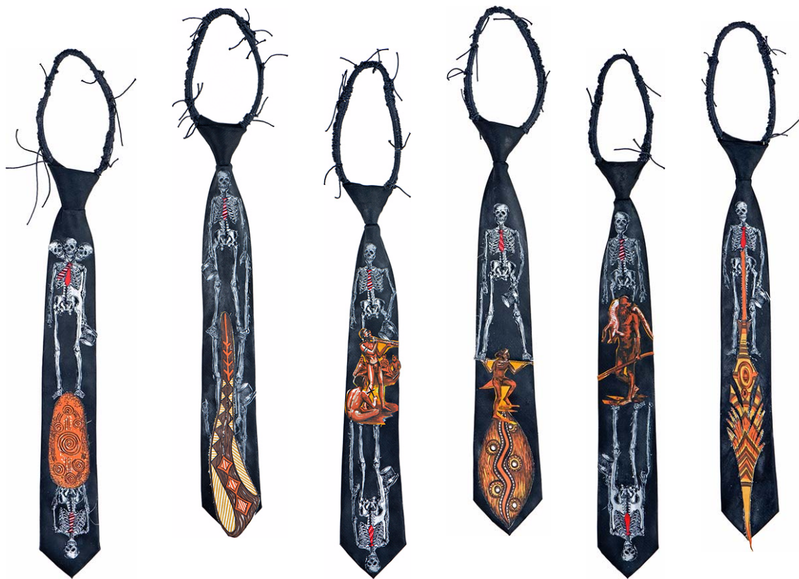
HUNG 2017 Mixed media 55 × 10 cm (each) $6,600 (set of six)