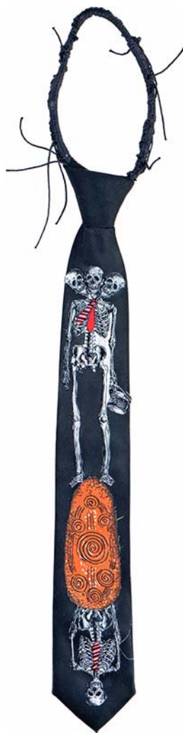
HUNG I 2017 Mixed media 55 × 10 cm