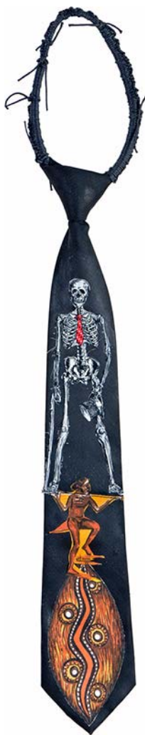
HUNG IV 2017 Mixed media 55 × 10 cm