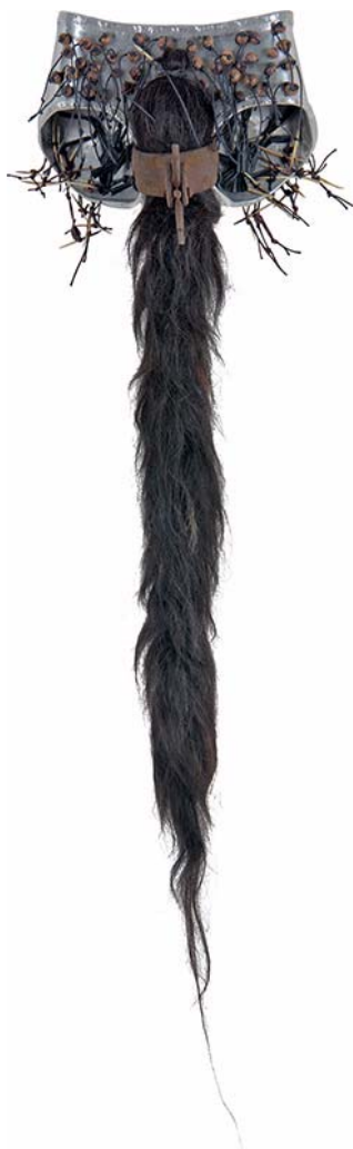
WARRIOR WOMAN VI 2017 Mixed media 30 × 18 × 10 cm (undies)