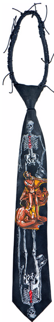
HUNG III 2017 Mixed media 55 × 10 cm