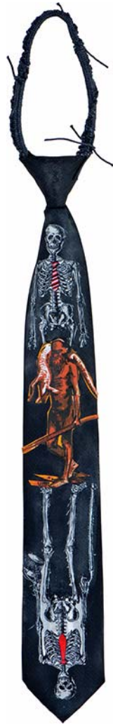
HUNG V2017 Mixed media 55 × 10 cm