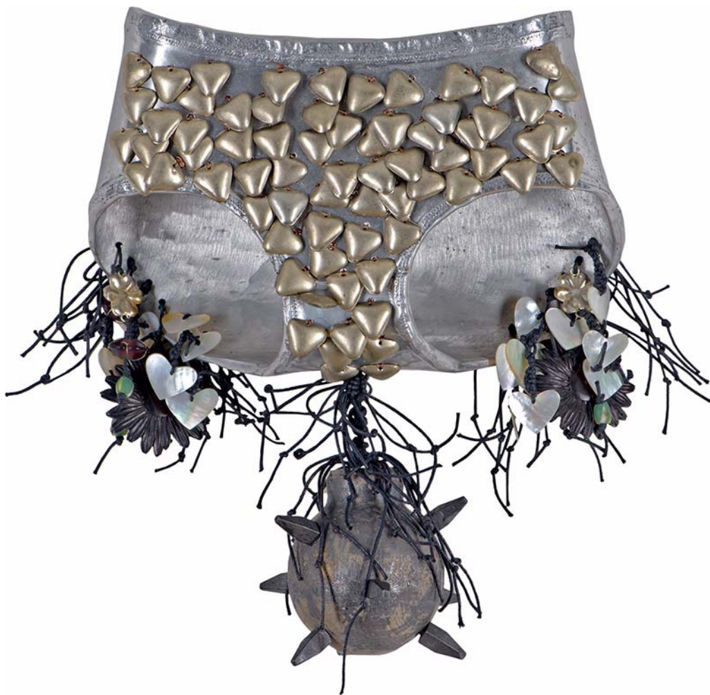
WARRIOR WOMAN XVII 2017