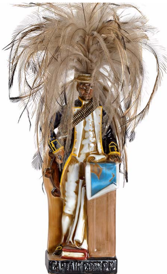
I'D BETTER GO AND GET SOMETHIN' HARDER #11 2015 (DETAIL)