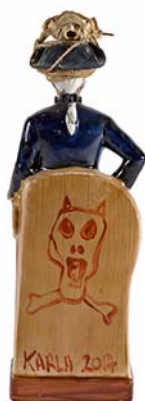
I'D BETTER GO AND GET SOMETHIN' HARDER #10 2015 (DETAIL—VERSO)