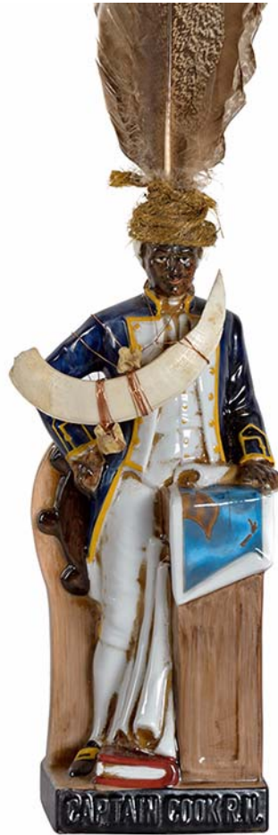
I'D BETTER GO AND GET SOMETHIN' HARDER #1 2014 (DETAIL)