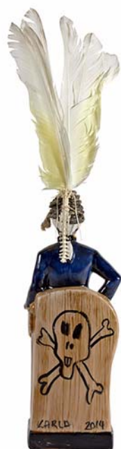
I'D BETTER GO AND GET SOMETHIN' HARDER #2 2014 (DETAIL—VERSO)