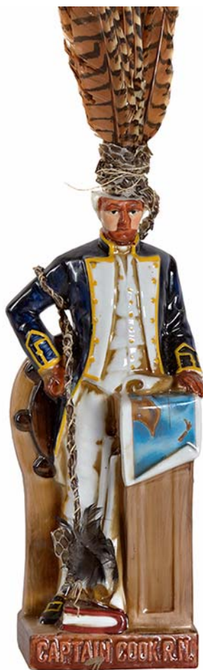
I'D BETTER GO AND GET SOMETHIN' HARDER #7 2014 (DETAIL)