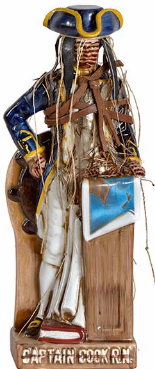
I'D BETTER GO AND GET SOMETHIN' HARDER #13 2014 (DETAIL)