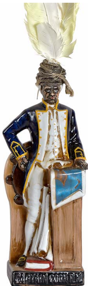
I'D BETTER GO AND GET SOMETHIN' HARDER #2 2014 (DETAIL)