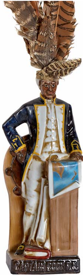
I'D BETTER GO AND GET SOMETHIN' HARDER #4 2014 (DETAIL)