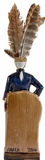
I'D BETTER GO AND GET SOMETHIN' HARDER #4 2014 (DETAIL—VERSO)