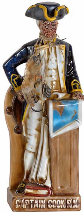
I'D BETTER GO AND GET SOMETHIN' HARDER #3 2014 (DETAIL)