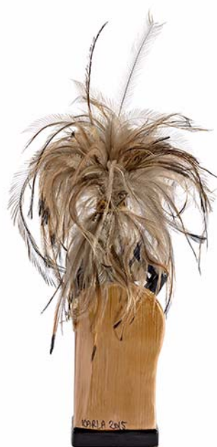
I'D BETTER GO AND GET SOMETHIN' HARDER #11 2015 (DETAIL—VERSO)