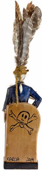
I'D BETTER GO AND GET SOMETHIN' HARDER #12 2014 (DETAIL—VERSO)