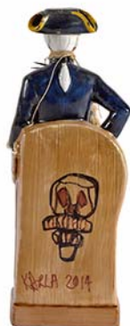
I'D BETTER GO AND GET SOMETHIN' HARDER #3 2014 (DETAIL—VERSO)