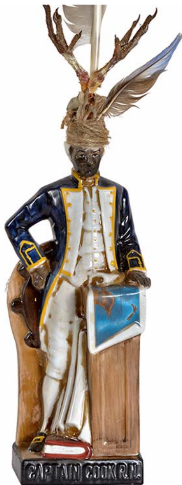
I'D BETTER GO AND GET SOMETHIN' HARDER #8 2014 (DETAIL)