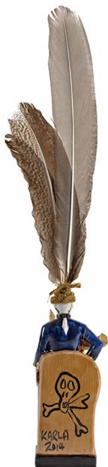
I'D BETTER GO AND GET SOMETHIN' HARDER #1 2014 (DETAIL—VERSO)