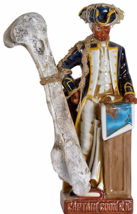
I'D BETTER GO AND GET SOMETHIN' HARDER #9 2014 (DETAIL)