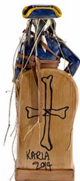
I'D BETTER GO AND GET SOMETHIN' HARDER #13 2014 (DETAIL—VERSO)