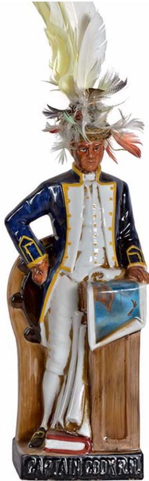
I'D BETTER GO AND GET SOMETHIN' HARDER #14 2014 (DETAIL)