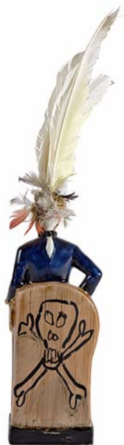
I'D BETTER GO AND GET SOMETHIN' HARDER #14 2014 (DETAIL—VERSO)