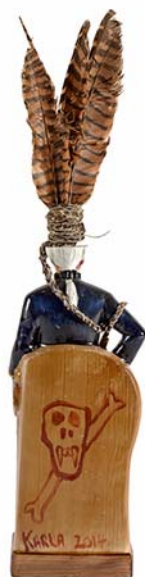
I'D BETTER GO AND GET SOMETHIN' HARDER #7 2014 (DETAIL—VERSO)