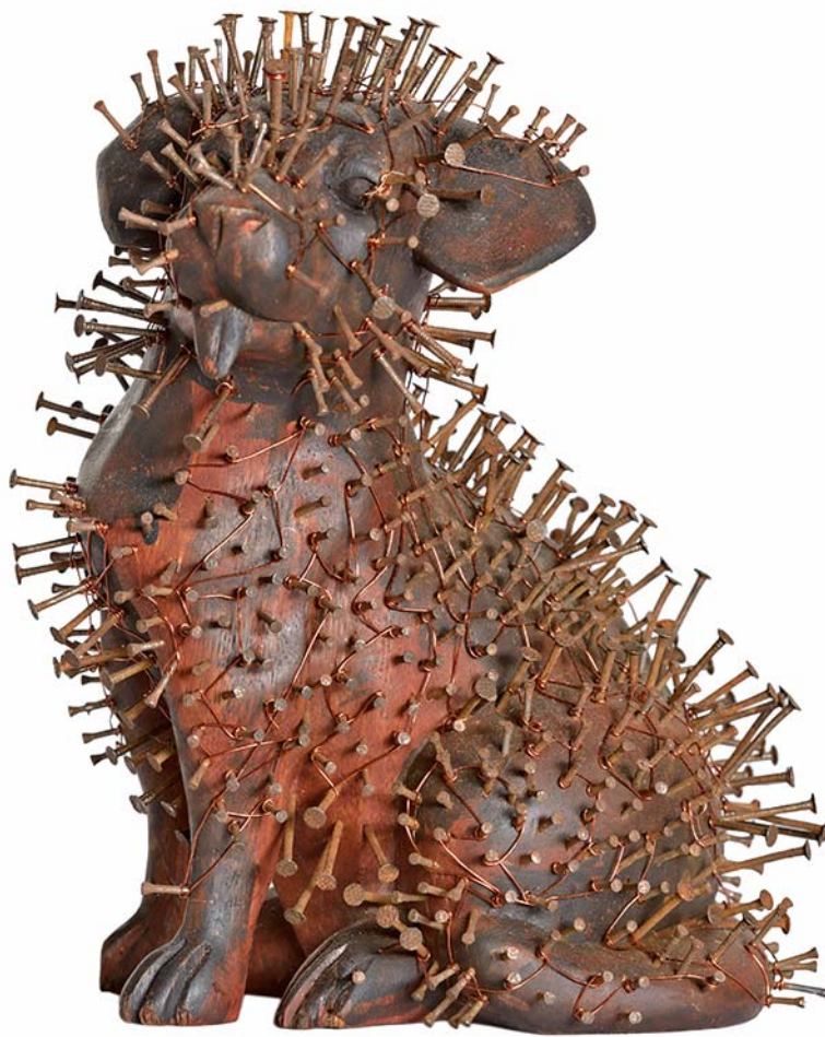
LITTLE BOY BLUE 2014