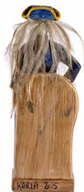
I'D BETTER GO AND GET SOMETHIN' HARDER #6 2015 (DETAIL—VERSO)