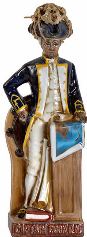
I'D BETTER GO AND GET SOMETHIN' HARDER #10 2014 (DETAIL)