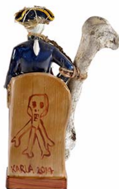
I'D BETTER GO AND GET SOMETHIN' HARDER #9 2014 (DETAIL—VERSO)