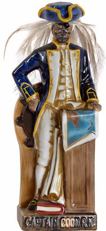
I'D BETTER GO AND GET SOMETHIN' HARDER #6 2014 (DETAIL)