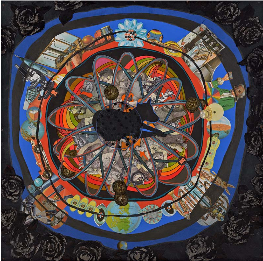
RESTING WITH THE WILD THINGS 2013