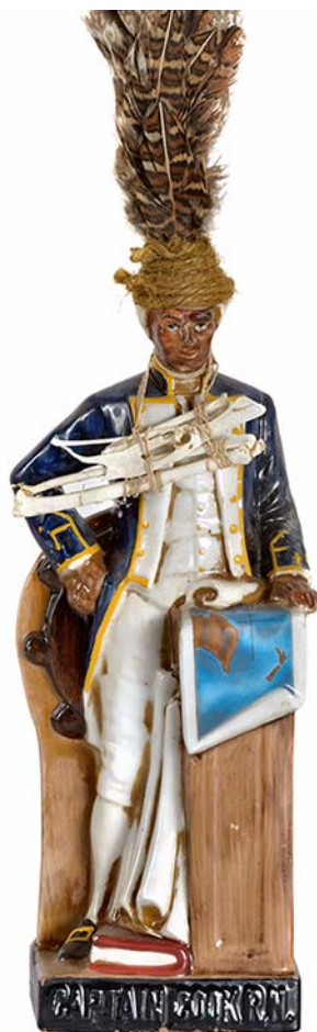
I'D BETTER GO AND GET SOMETHIN' HARDER #12 2014 (DETAIL)