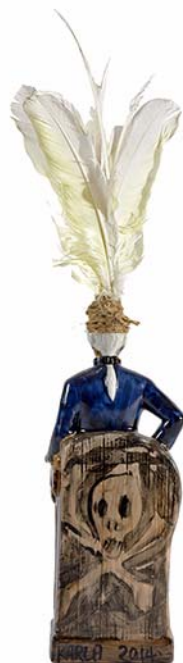
I'D BETTER GO AND GET SOMETHIN' HARDER #5 2014 (DETAIL—VERSO)