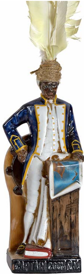
I'D BETTER GO AND GET SOMETHIN' HARDER #5 2014 (DETAIL)