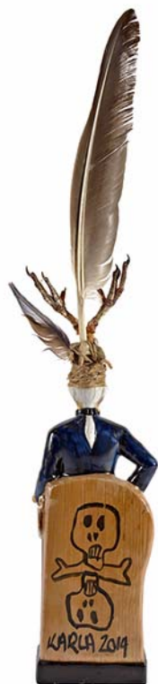
I'D BETTER GO AND GET SOMETHIN' HARDER #8 2014 (DETAIL—VERSO)