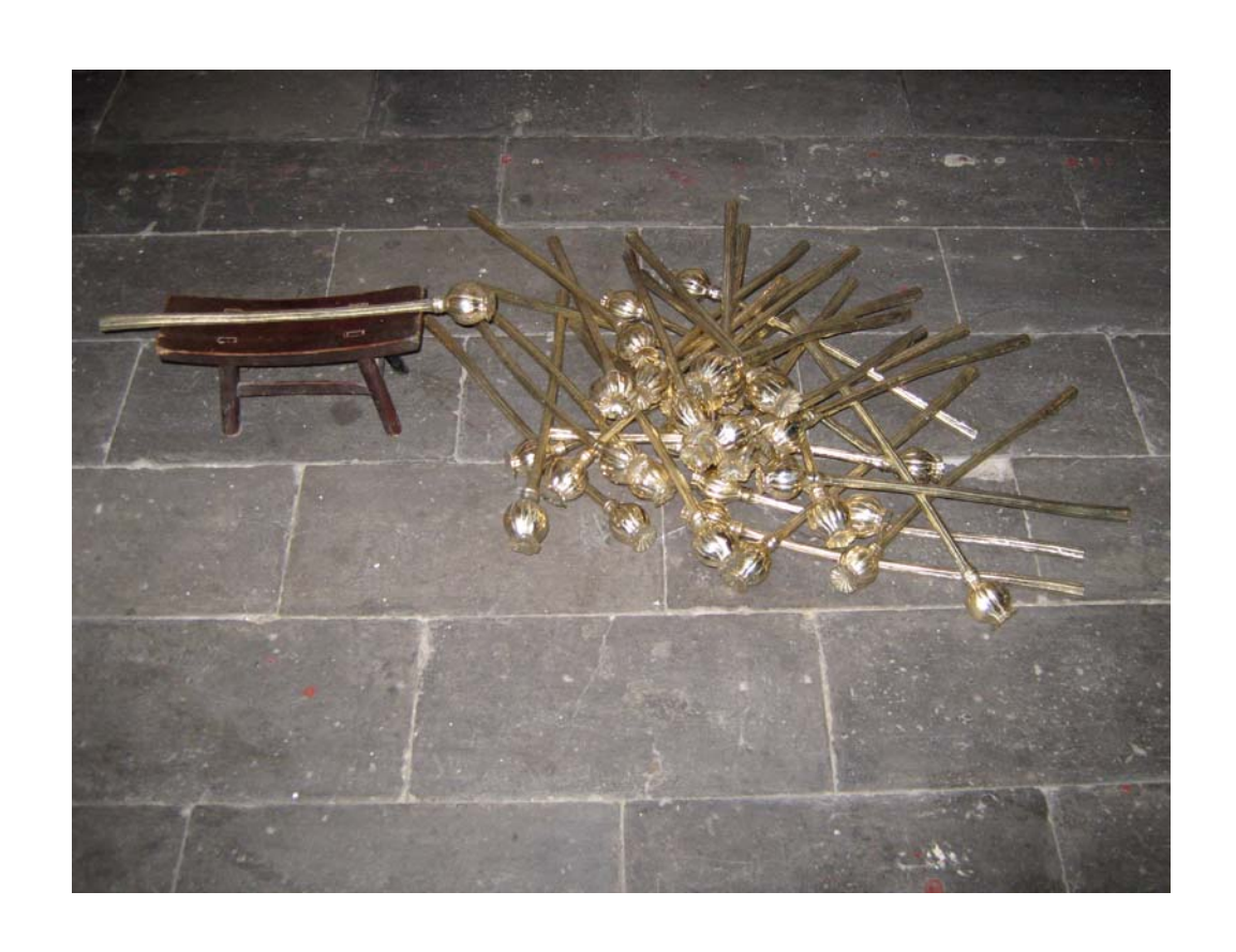
LET A HUNDRED FLOWERS BLOOM 2010 Detail