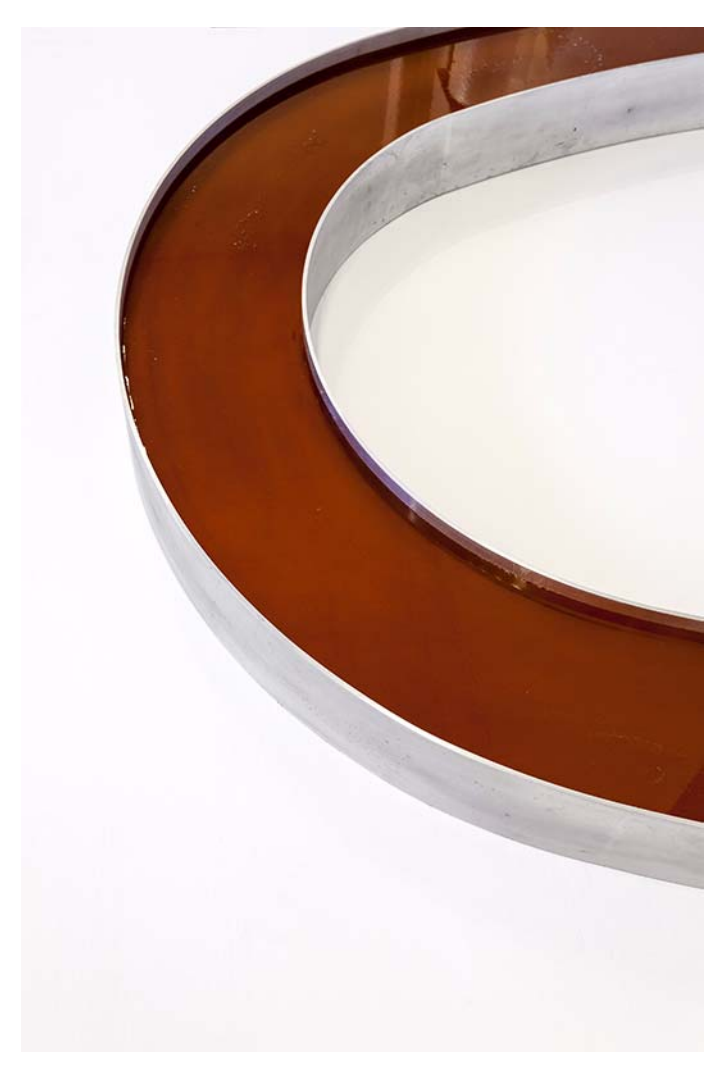
I.O.U. 2016 (DETAIL)