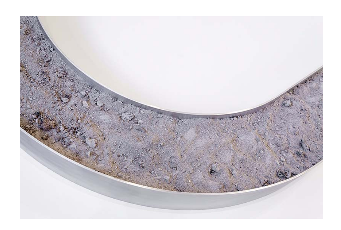
I.O.U. 2016 (DETAIL)