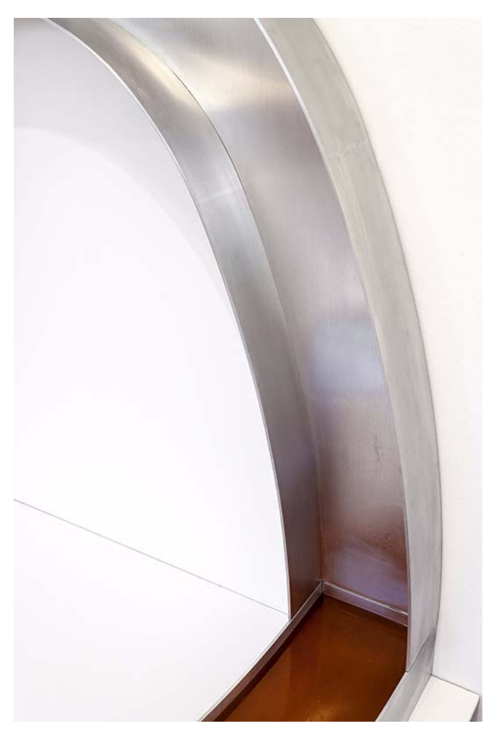
I.O.U. 2016 (DETAIL)