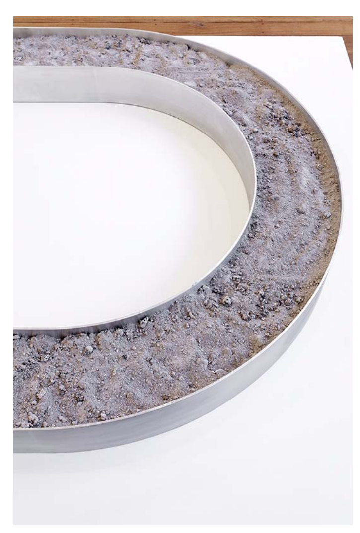
I.O.U. 2016 (DETAIL)