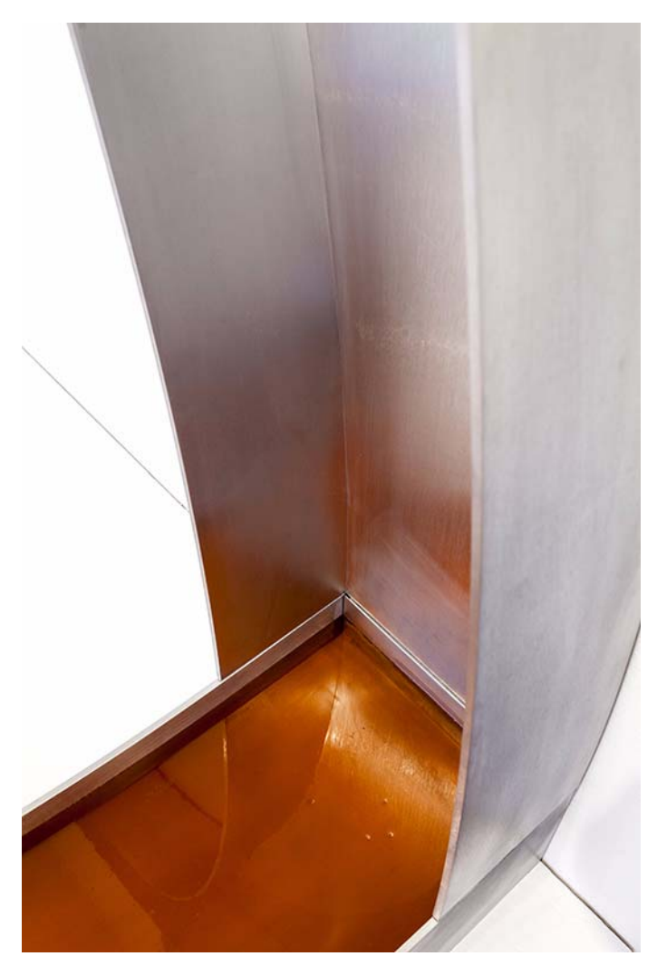
I.O.U. 2016 (DETAIL)