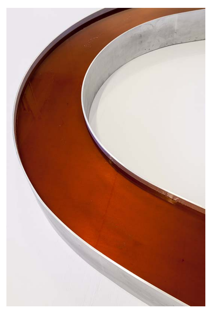
I.O.U. 2016 (DETAIL)