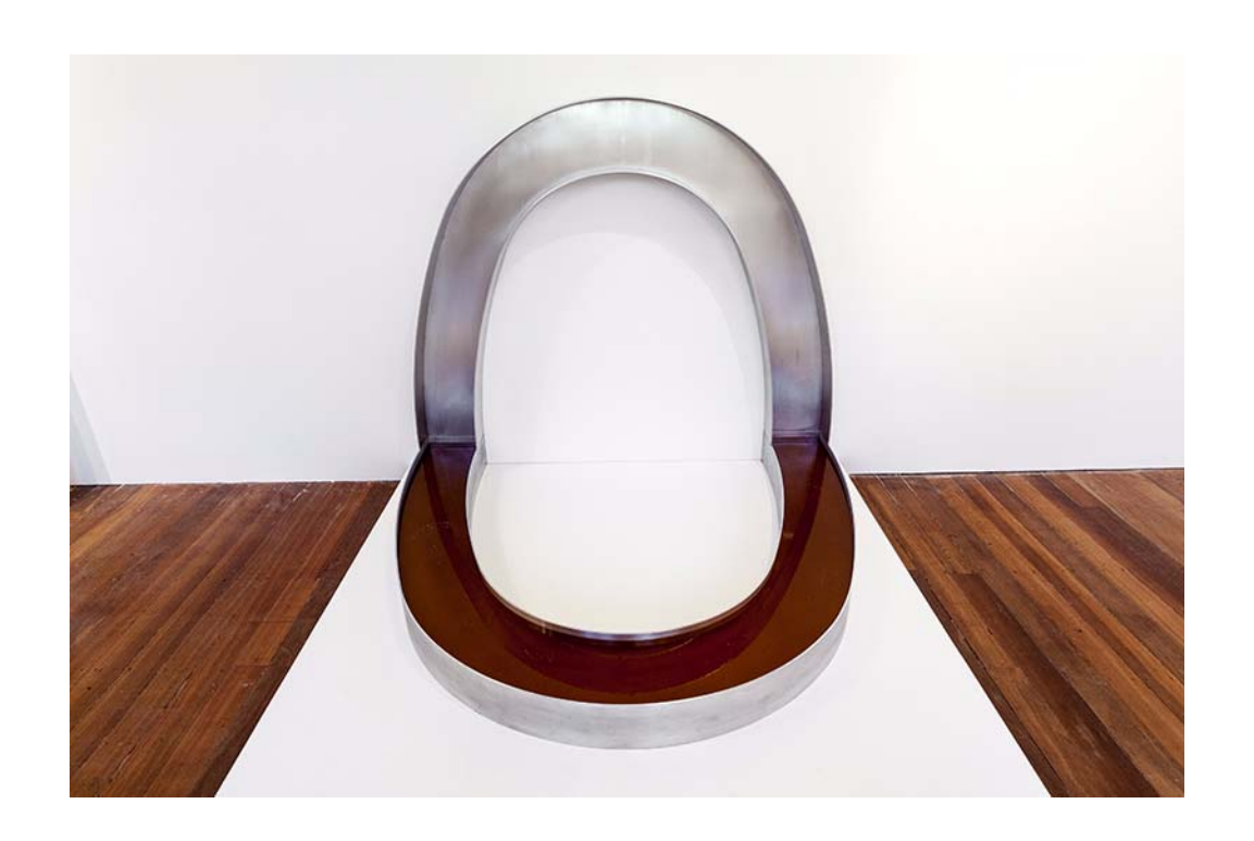
I.O.U. 2016 (DETAIL)