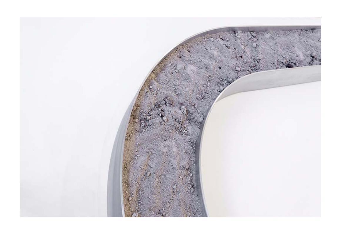
I.O.U. 2016 (DETAIL)