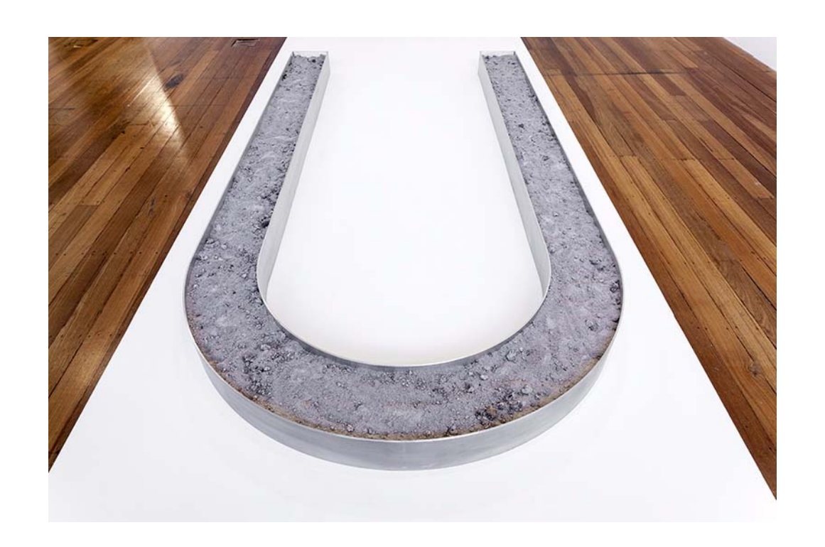
I.O.U. 2016 (DETAIL)