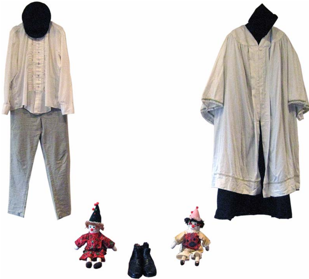
THE PROTAGONISTS 2017 Mixed media $22,000