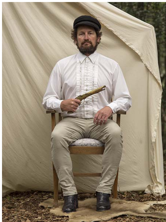
COLONIAL CAPTOR 2017 Fujiflex digital print, edition 15 45 × 33 cm $1,100 (unframed)