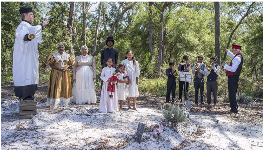
MISSIONARY ZEAL 2017 Fujiflex digital print, edition 15 45 × 80 cm $2,200 (unframed)