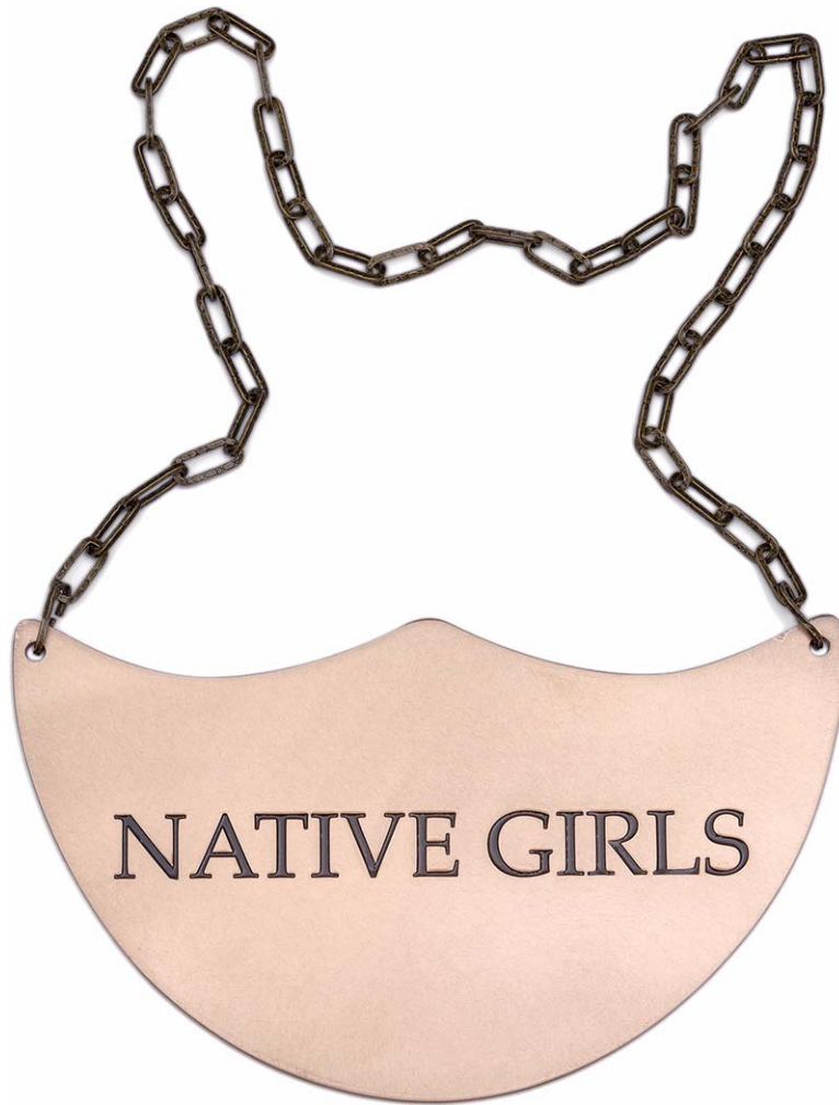
NATIVE GIRLS 2017 Brass and enamel paint, edition 3 13 × 23 cm $2,200