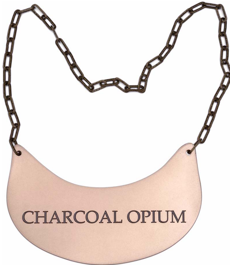
CHARCOAL OPIUM 2017 Brass and enamel paint, edition 3 13 × 22 cm $2,200