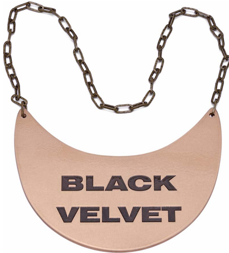
BLACK VELVET 2017 Brass and enamel paint, edition 3 17 × 22 cm $2,200