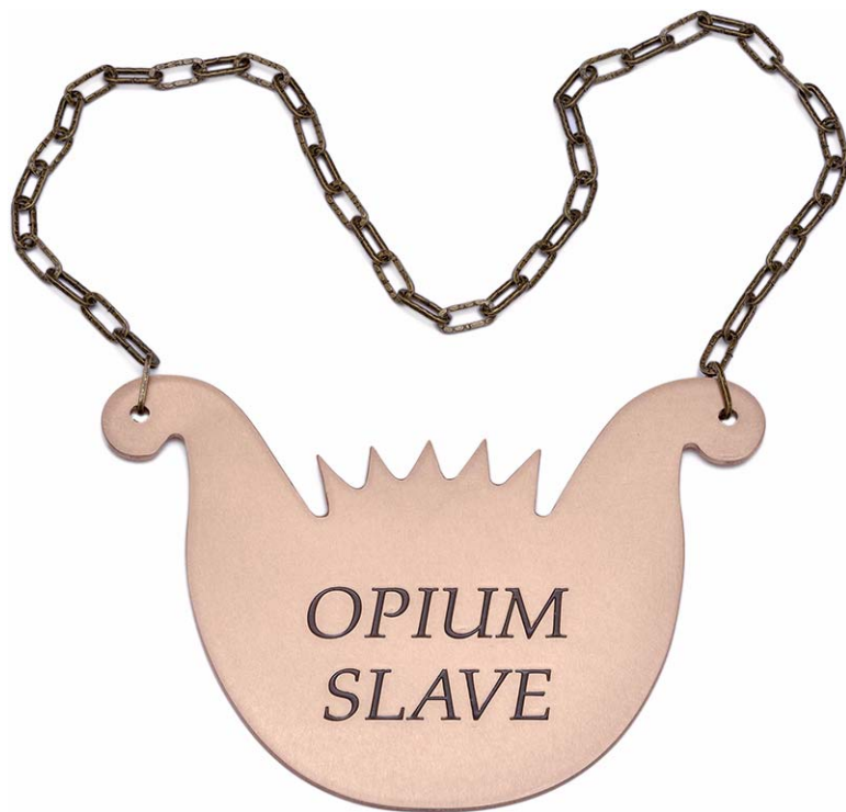
OPIUM SLAVE 2017 Brass and enamel paint, edition 3 15 × 22 cm $2,200