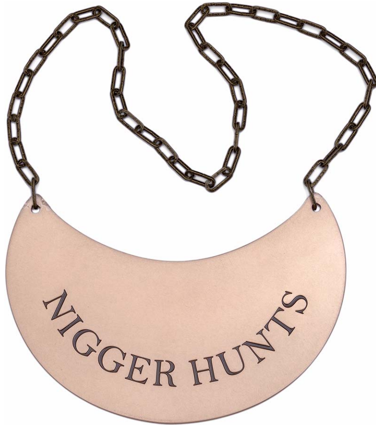
NIGGER HUNTS 2017 Brass and enamel paint, edition 3 15 × 23 cm $2,200