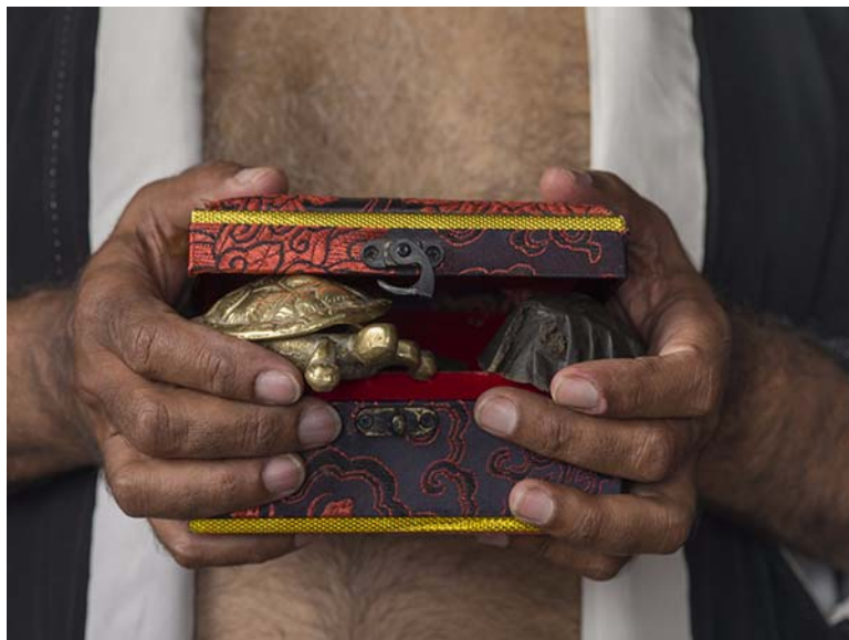
LUCKY DIP 2017 Fujiflex digital print, edition 15 33 × 45 cm $1,100 (unframed)