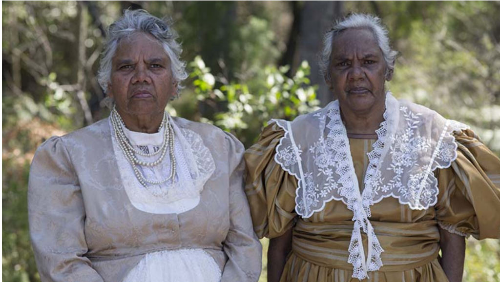
SILENT WITNESSES 2017 Fujiflex digital print, edition 15 45 × 80 cm $2,200 (unframed)