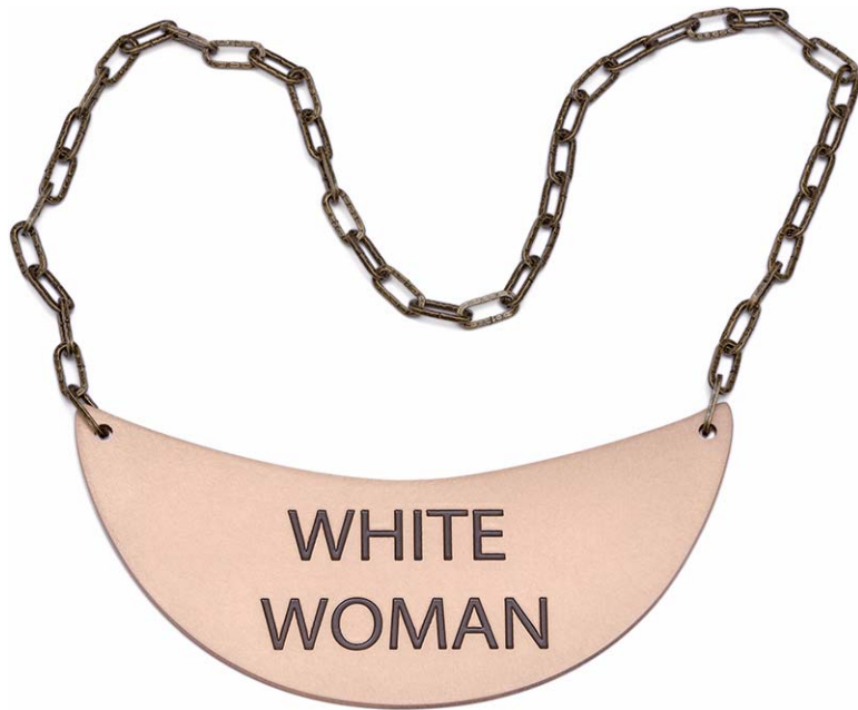
WHITE WOMAN 2017 Brass and enamel paint, edition 3 10 × 22 cm $2,200