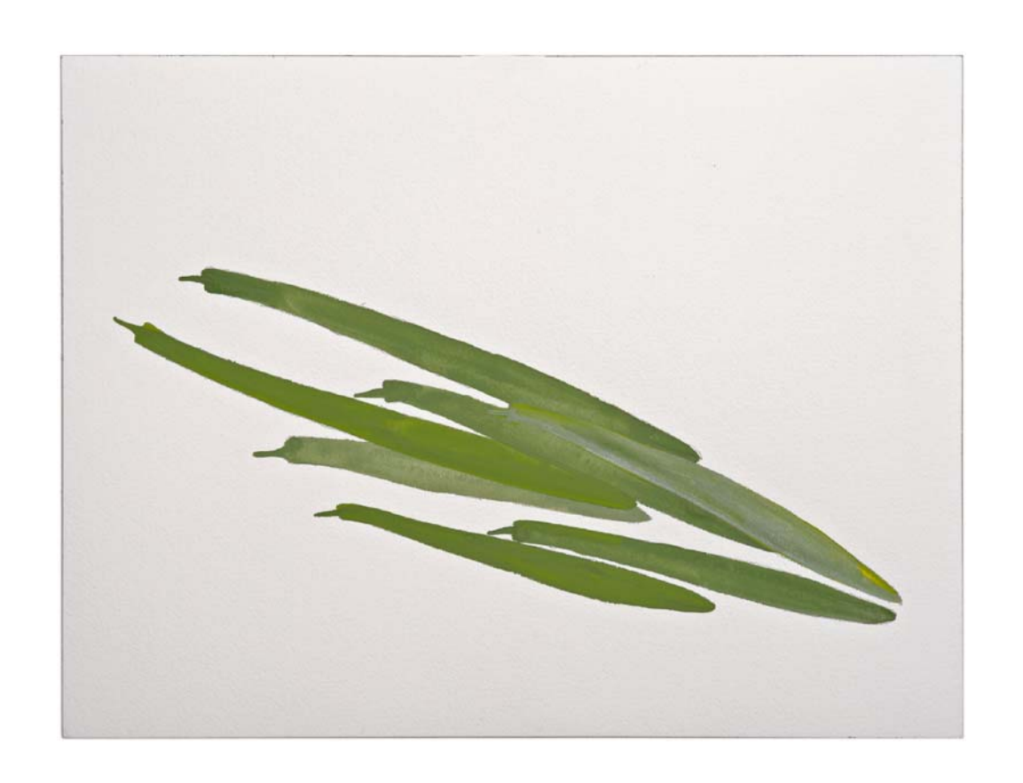
FLOTSAM AND JETSAM #22 (2011) Gouache, aquarelle and graphite on Arches paper 31 x 41 cm $2,200