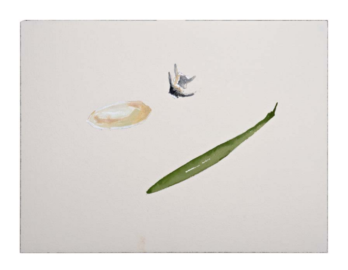
FLOTSAM AND JETSAM #13 (2011) Gouache, graphite and aquarelle on Arches paper 31 x 41 cm $2,200