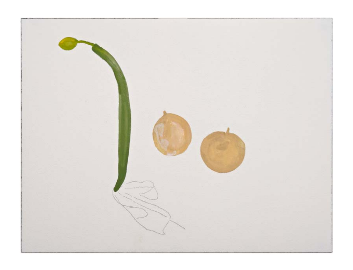
FLOTSAM AND JETSAM #9 (2011) Gouache and graphite on Arches paper 31 x 41 cm $2,200