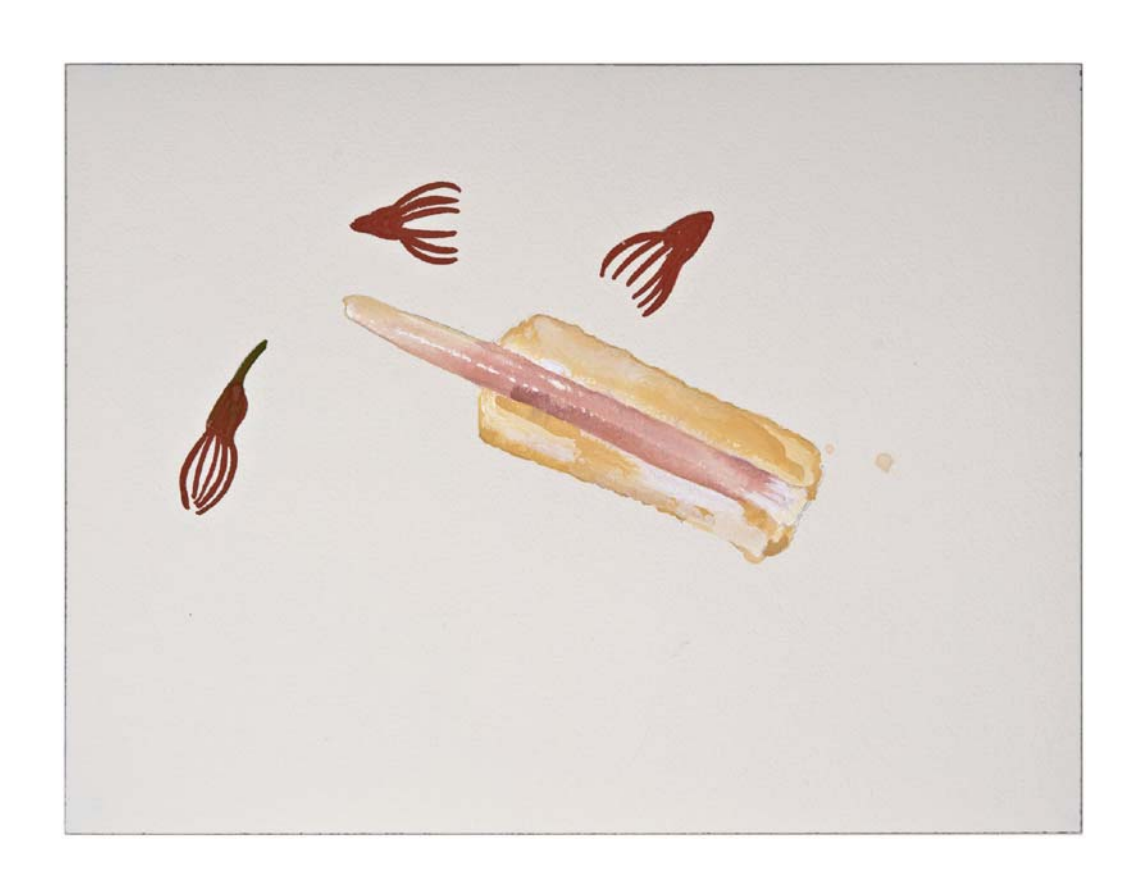
FLOTSAM AND JETSAM #19 (2011) Gouache and graphite on Arches paper 31 x 41 cm $2,200