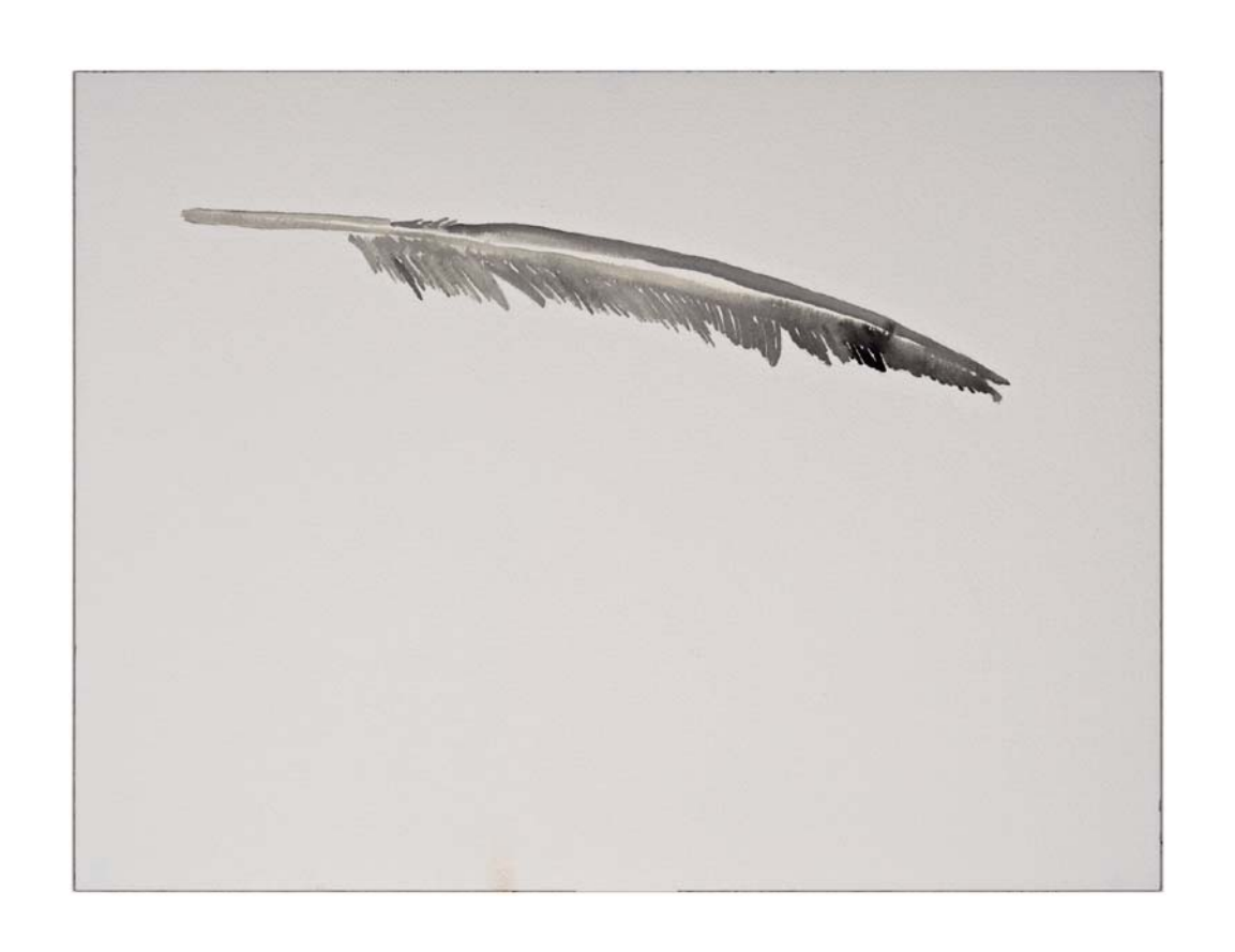
FLOTSAM AND JETSAM #15 (2011) Gouache and graphite on Arches paper 31 x 41 cm $2,200