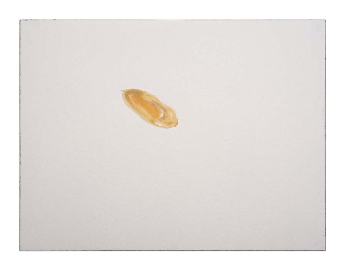
FLOTSAM AND JETSAM #7 (2011) Gouache and graphite on Arches paper 31 x 41 cm $2,200