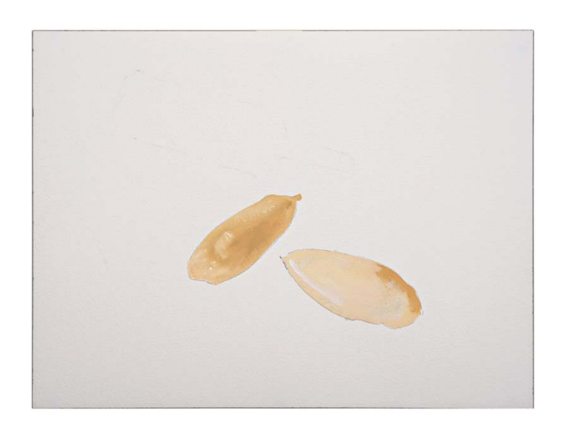
FLOTSAM AND JETSAM #14 (2011) Gouache and graphite on Arches paper 31 x 41 cm $2,200