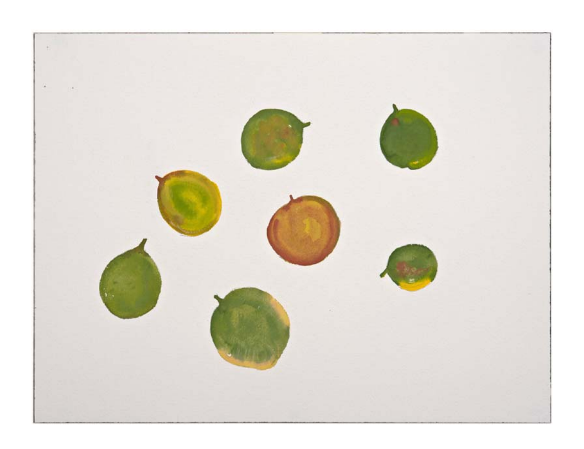
FLOTSAM AND JETSAM #2 (2011) Gouache and graphite on Arches paper 31 x 41 cm $2,200