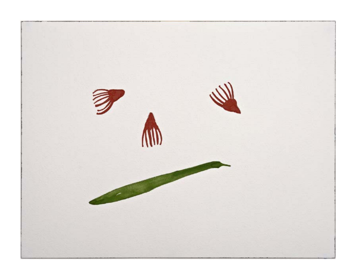
FLOTSAM AND JETSAM #20 (2011) Gouache and graphite on Arches paper 31 x 41 cm $2,200