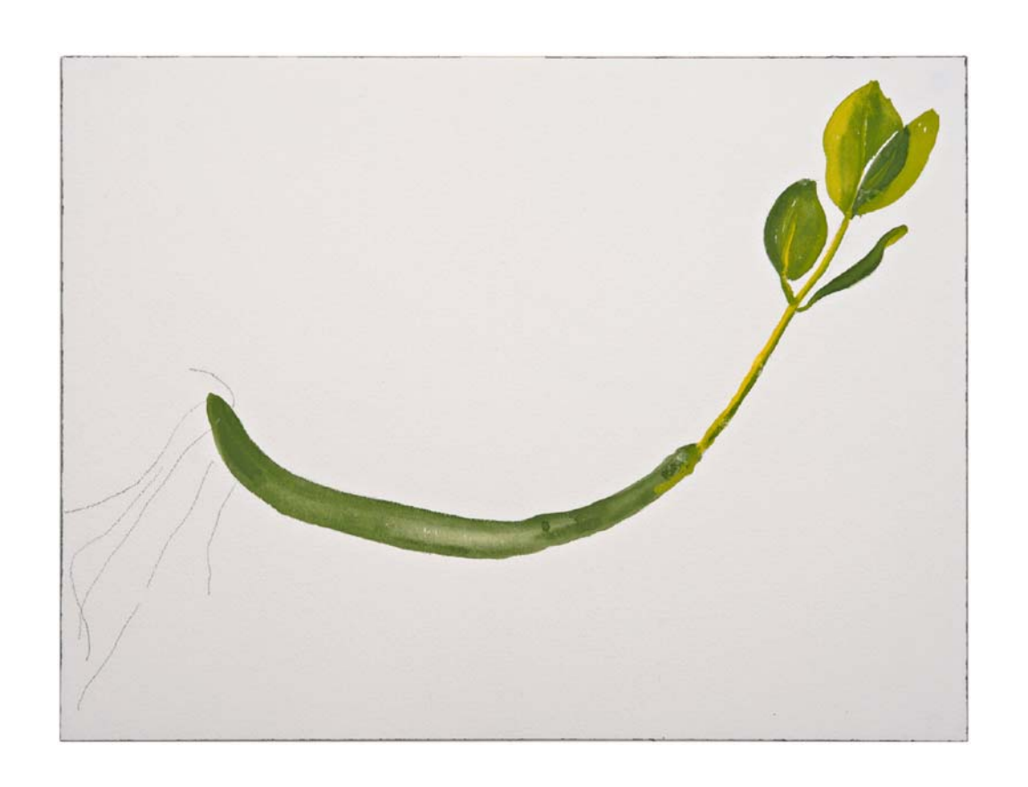
FLOTSAM AND JETSAM #5 (2011) Gouache and graphite on Arches paper 31 x 41 cm $2,200