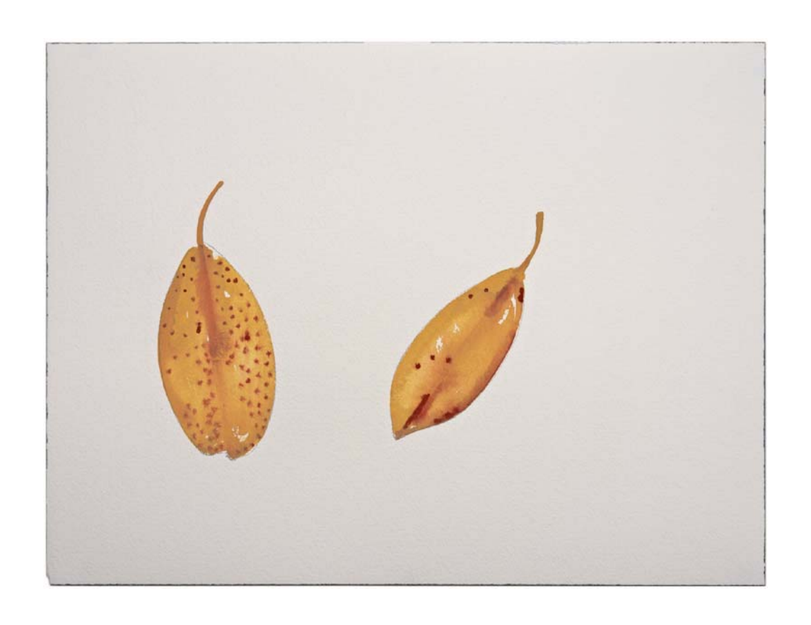
FLOTSAM AND JETSAM #11 (2011) Gouache and graphite on Arches paper 31 x 41 cm $2,200