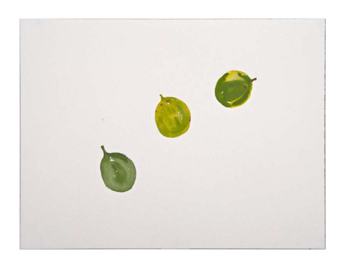
FLOTSAM AND JETSAM #8 (2011) Gouache and graphite on Arches paper 31 x 41 cm $2,200