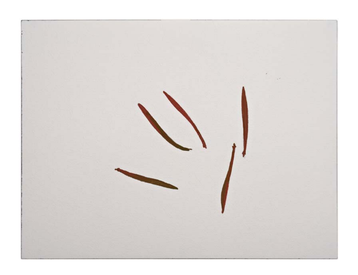
FLOTSAM AND JETSAM #17 (2011) Gouache and graphite on Arches paper 31 x 41 cm $2,200