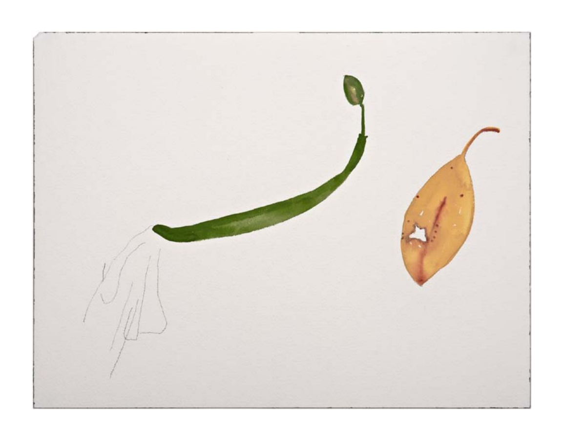
FLOTSAM AND JETSAM #12 (2011) Gouache and graphite on Arches paper 31 x 41 cm $2,200