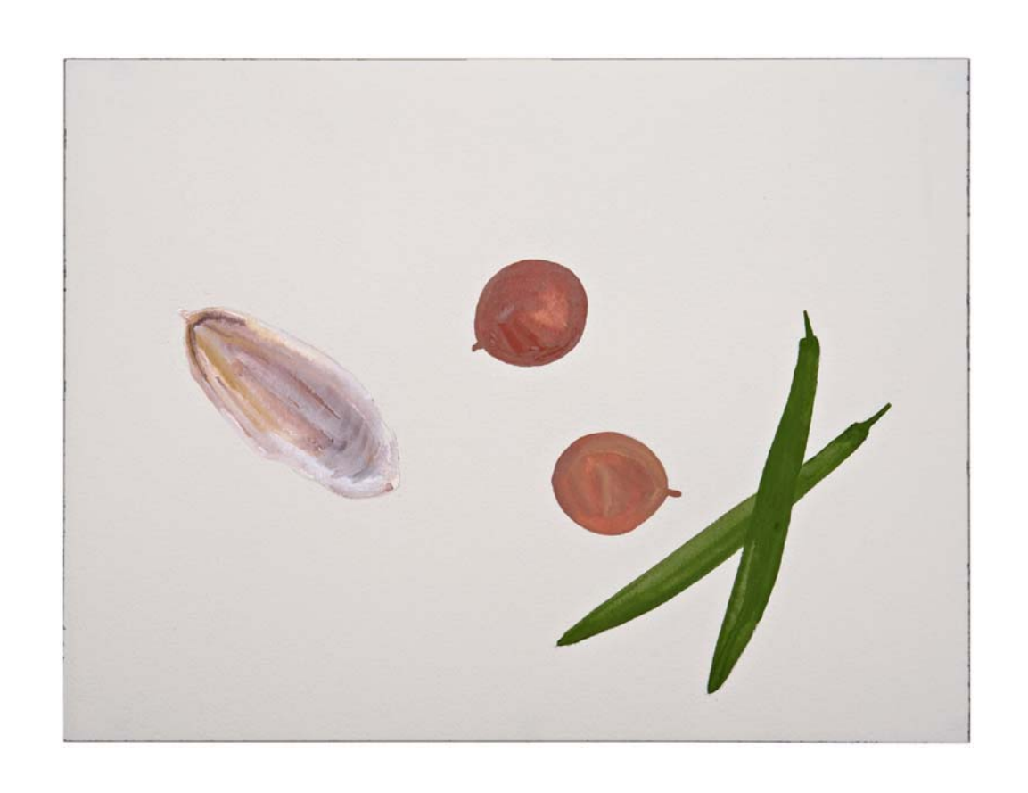
FLOTSAM AND JETSAM #6 (2011) Gouache, aquarelle and graphite on Arches paper 31 x 41 cm $2,200