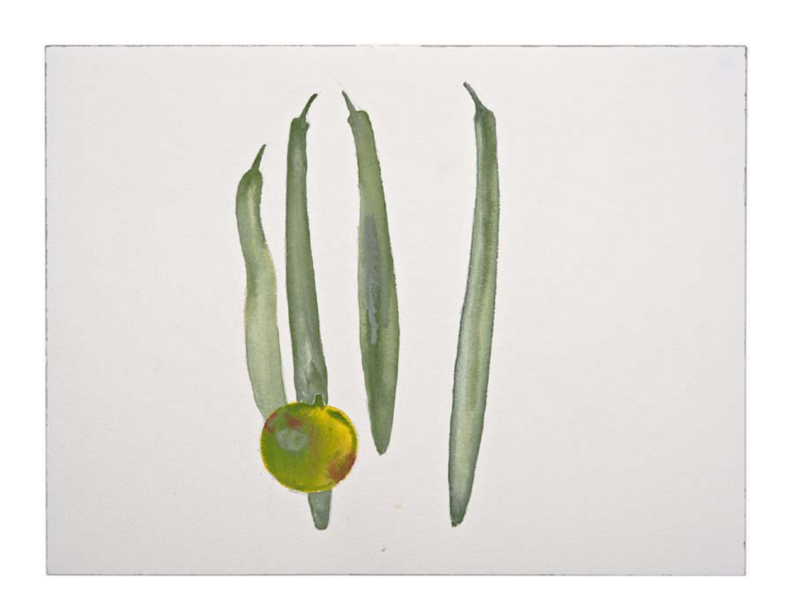
FLOTSAM AND JETSAM #21 (2011) Gouache, aquarelle and graphite on Arches paper 31 x 41 cm $2,200