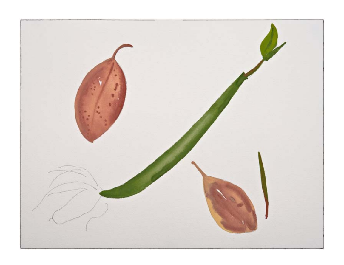
FLOTSAM AND JETSAM #1 (2011) Gouache and graphite on Arches paper 31 x 41 cm $2,200