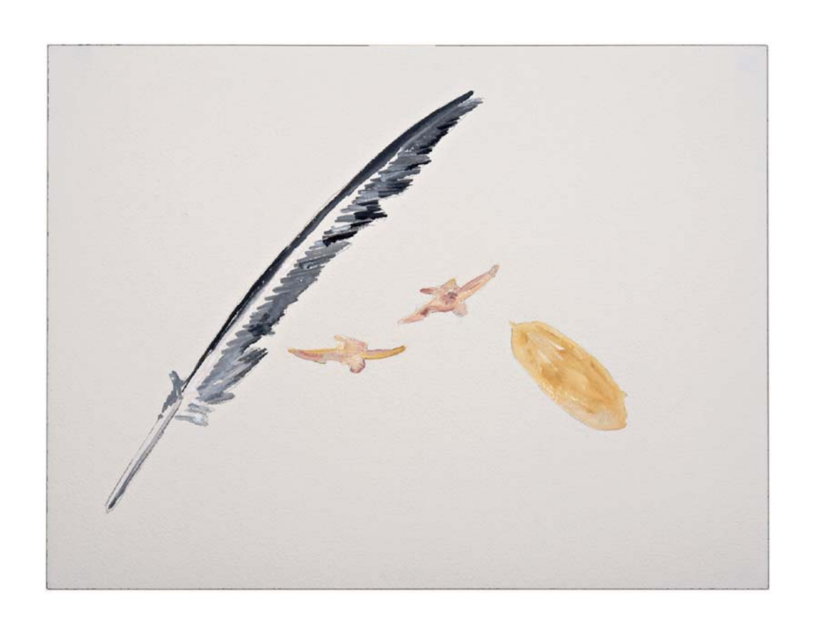
FLOTSAM AND JETSAM #4 (2011) Gouache and graphite on Arches paper 31 x 41 cm $2,200