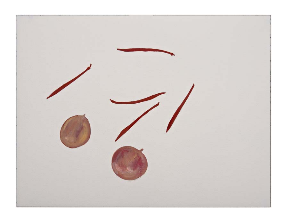
FLOTSAM AND JETSAM #16 (2011) Gouache, aquarelle and graphite on Arches paper 31 x 41 cm $2,200