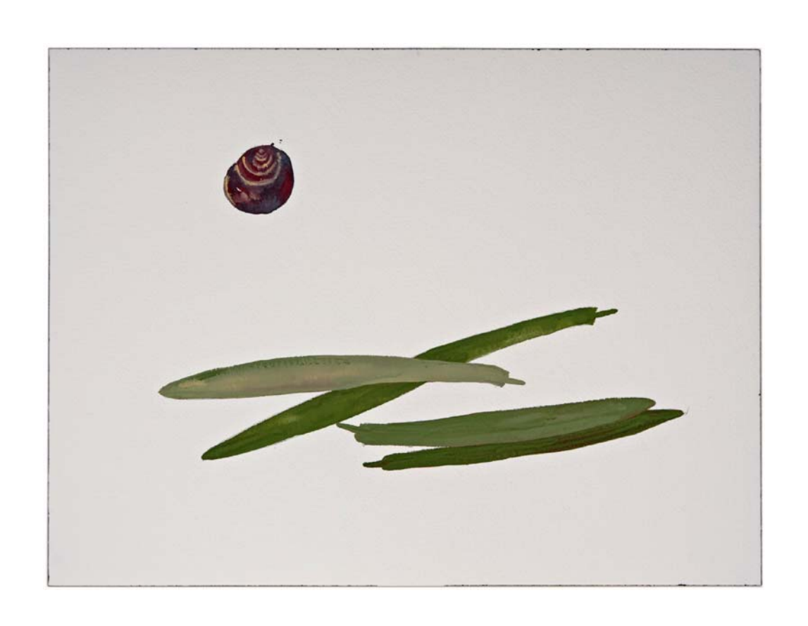
FLOTSAM AND JETSAM #18 (2011) Gouache and graphite on Arches paper 31 x 41 cm $2,200