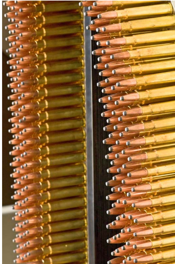
DISPERSED 2008 Detail