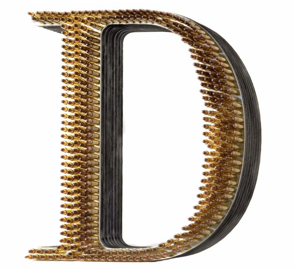
DISPERSED 2008 Detail