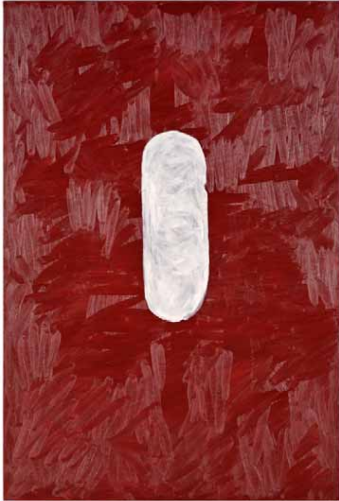
SHIELD (2010) Oil on linen 152 x 102 cm $8,800