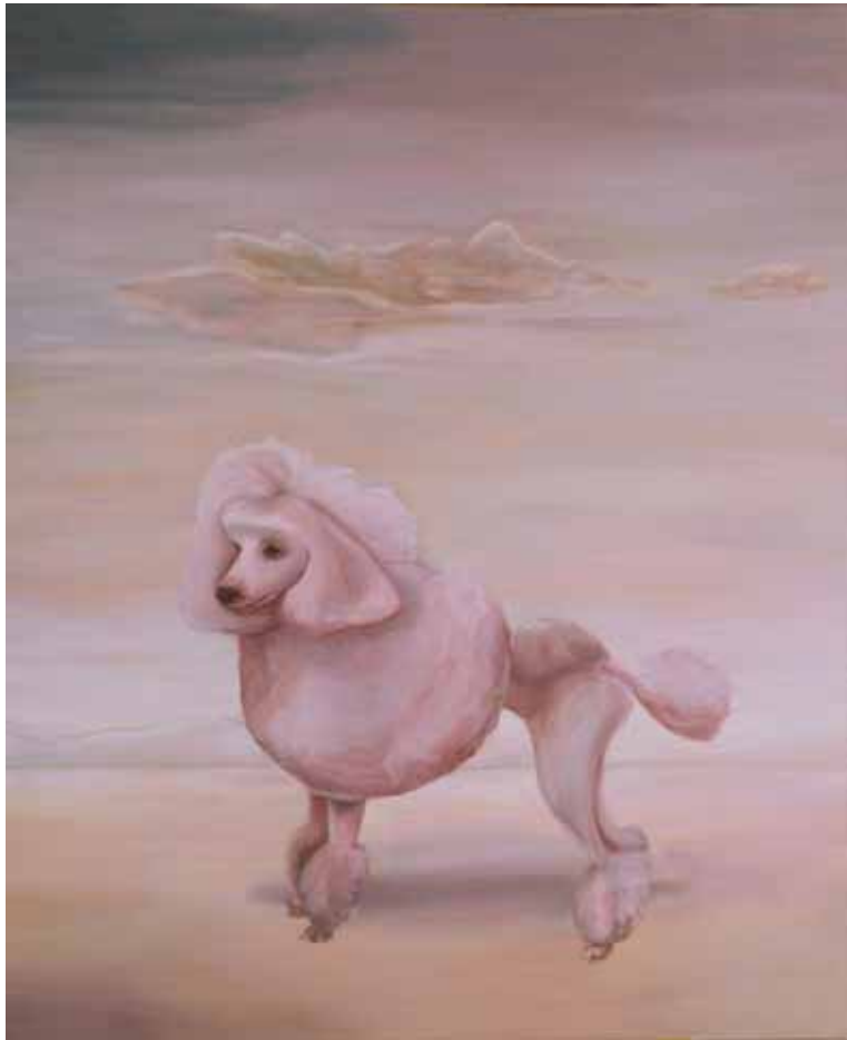
TROY (2008) Oil on linen 60 x 50 cm $4,400